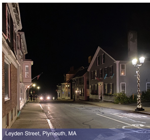
Leyden Street, Plymouth, MA