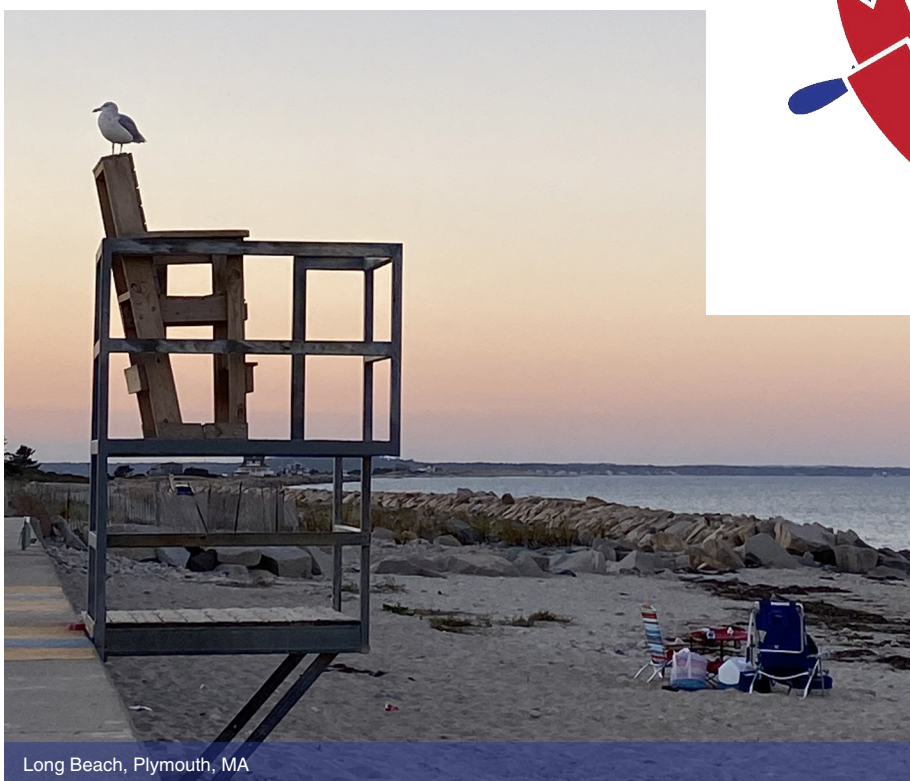
Long Beach, Plymouth, MA