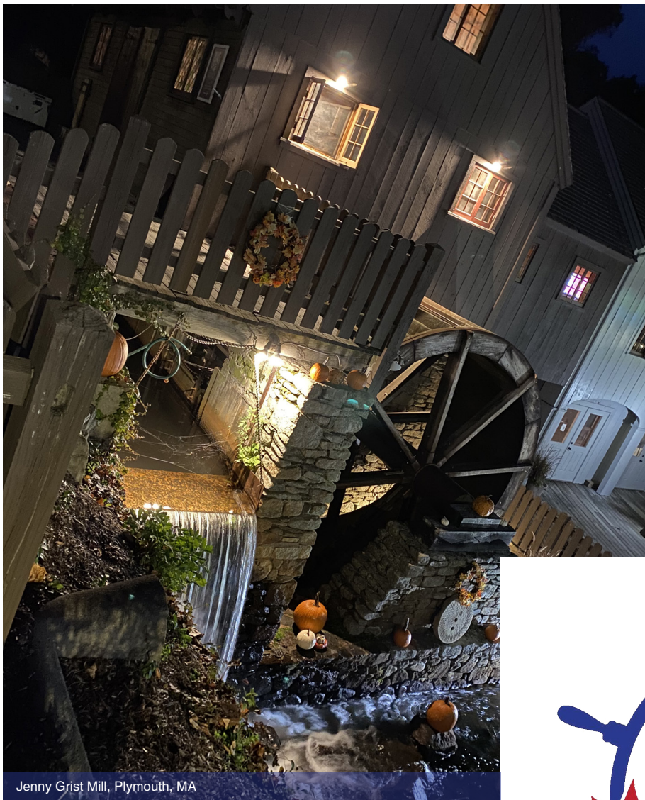
Jenny Grist Mill, Plymouth, MA