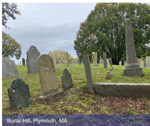
Burial Hill, Plymouth, MA