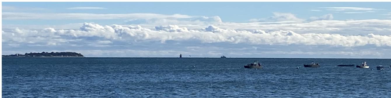
(L-R) Saquish portion of Duxbury, Bug Light and boats overlooking Plymouth Bay, Plymouth, MA

The pandemic has left us all feeling a little rattled. In this session we will have fun discussing ways to bring our Confidence Back! Additionally, we will learn strategies to deal with escalated issues and approach intense customer situations.