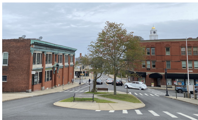
Plymouth Town Square, Plymouth, MA

Financial aid leaders are critical to achieving the enrollment goals at most institutions but there is a growing gap between supply and demand for qualified and engaged financial aid professionals to fill leadership roles. How do financial aid administrators prepare themselves for advancement? Do they focus on technical skills, compliance, and advanced degrees/certifications or soft skills and volunteerism? Join this panel discussion to explore the kinds of skills and experiences institutions are looking for when hiring or promoting for senior financial aid roles. The panelists will share their leadership journeys and will offer practical advice to help advance your career in financial aid.