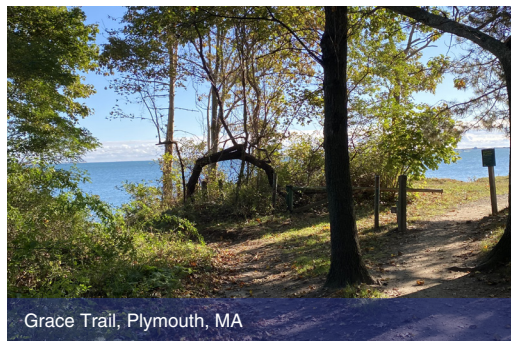
Grace Trail, Plymouth, MA